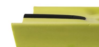
Waterfall front edge